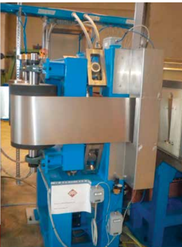
Steering rolls electronic control