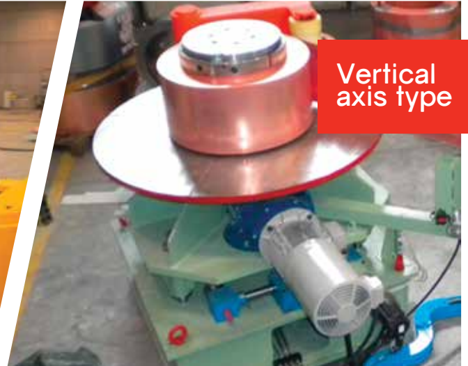
Vertical axis type