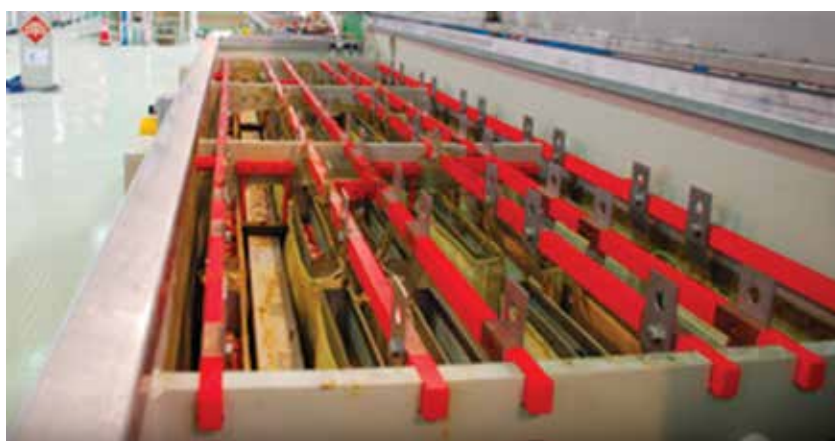
Vertical axis type plating cell