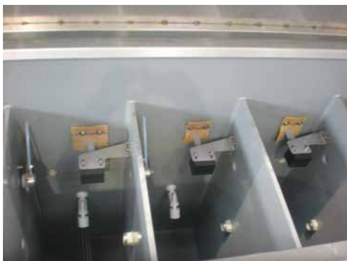
Cascade Rinses, Save Water System