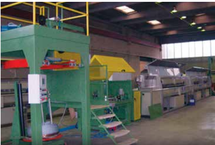
Zinc and polishing die block