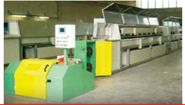
OTO 4 XL up to 8 mm