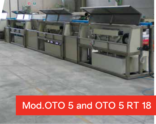
Mod.OTO 5 and OTO 5 RT 18