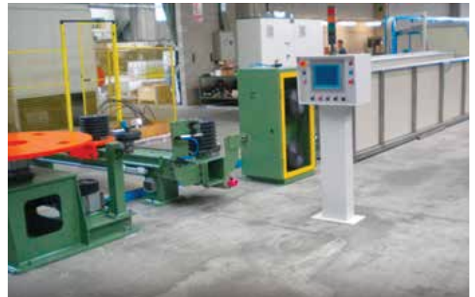
Round - flat wire heavy electro coated